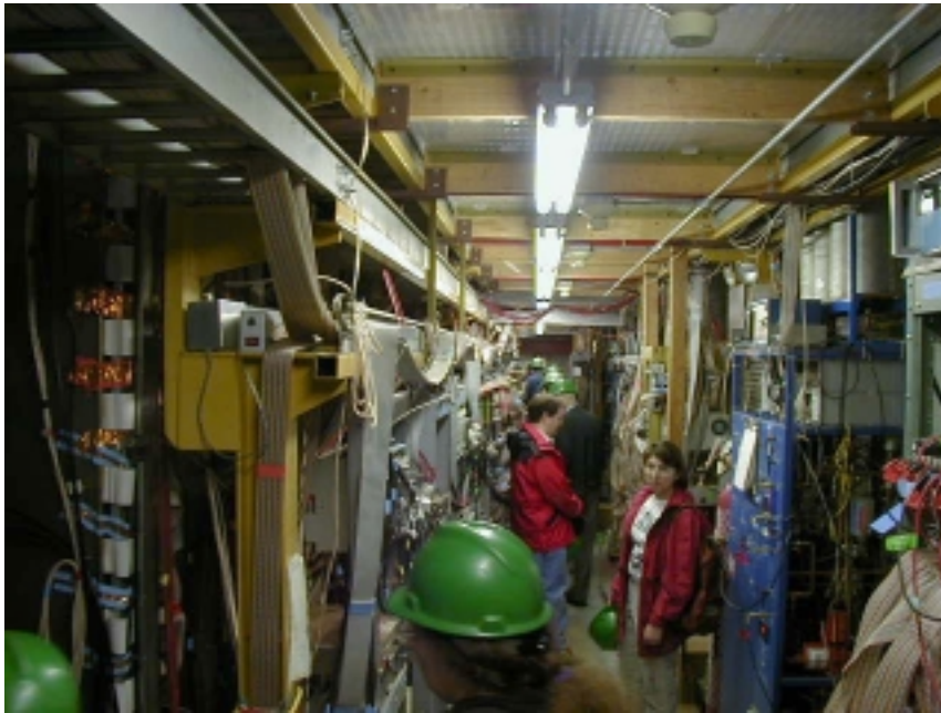
An cavern deep underground, filled with neutrino and muon detectors.

For example, because they wanted to eliminate all possible sources of radiation, circuit boards had to be built out of Kevlar because the standard fiberglass material is slightly radioactive. Similarly, when they needed lead, ordinary lead was unacceptable because it is slightly radioactive from exposure to cosmic rays. The solution was to bring up lead from the bottom of the Caribbean than had been used as ballast for Spanish galleons that had sunk 300 years ago.